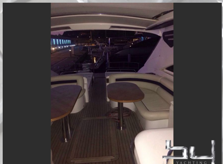
outside view - picture 12