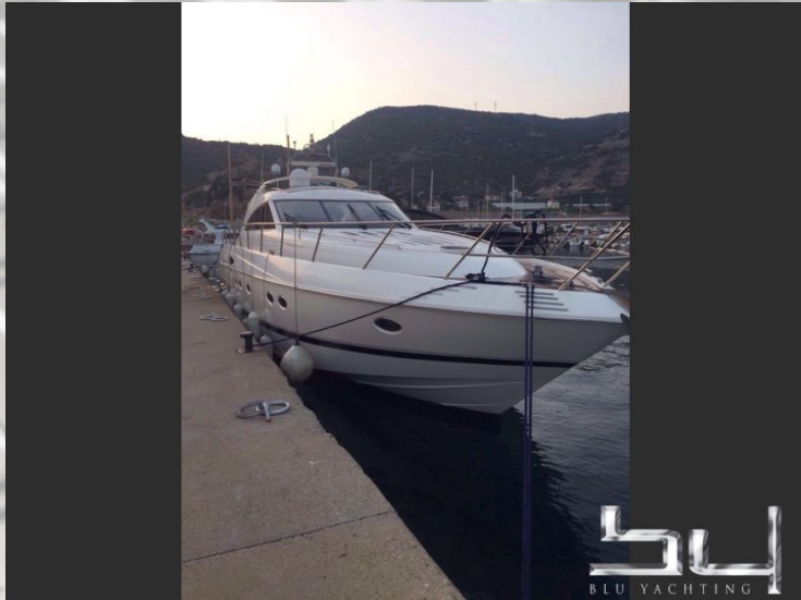
outside view - picture 1