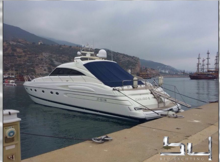
outside view - picture 2