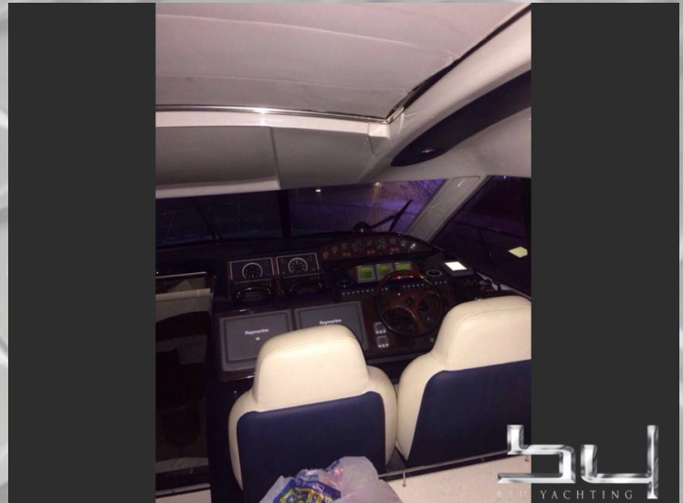
outside view - picture 16