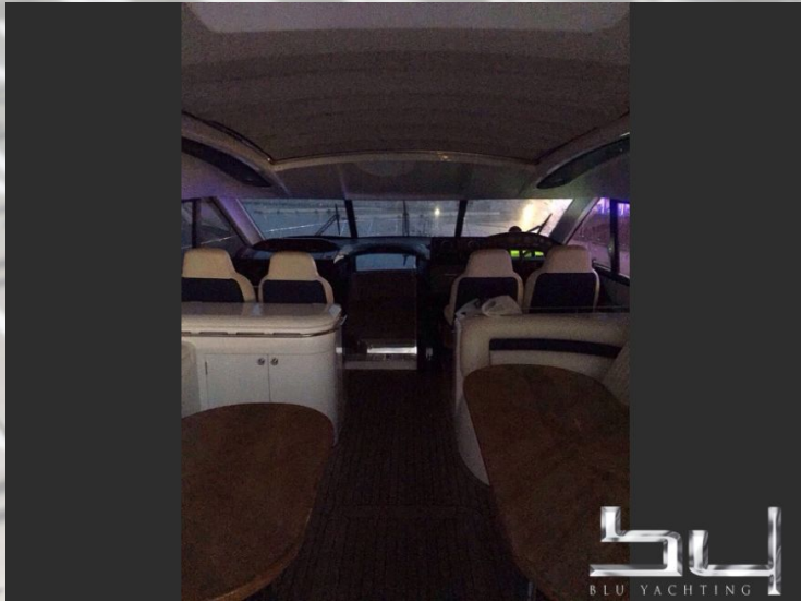
outside view - picture 7