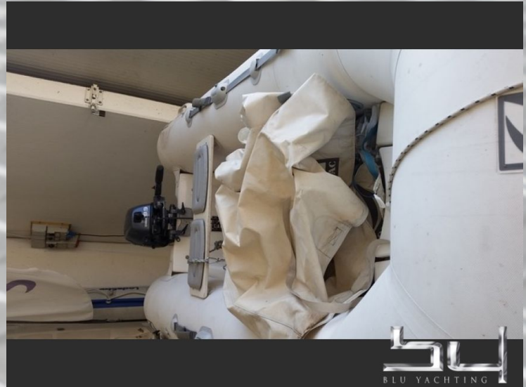
outside view - picture 2