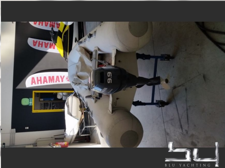
outside view - picture 3