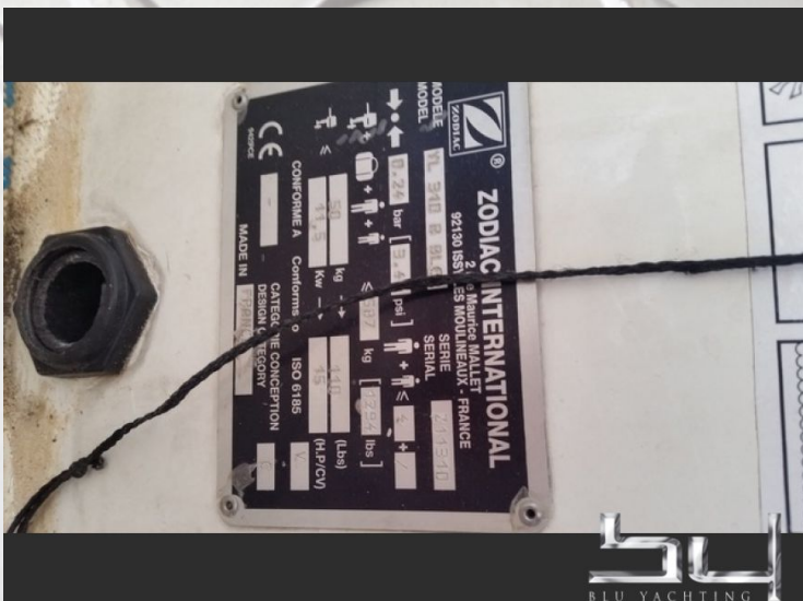
outside view - picture 5