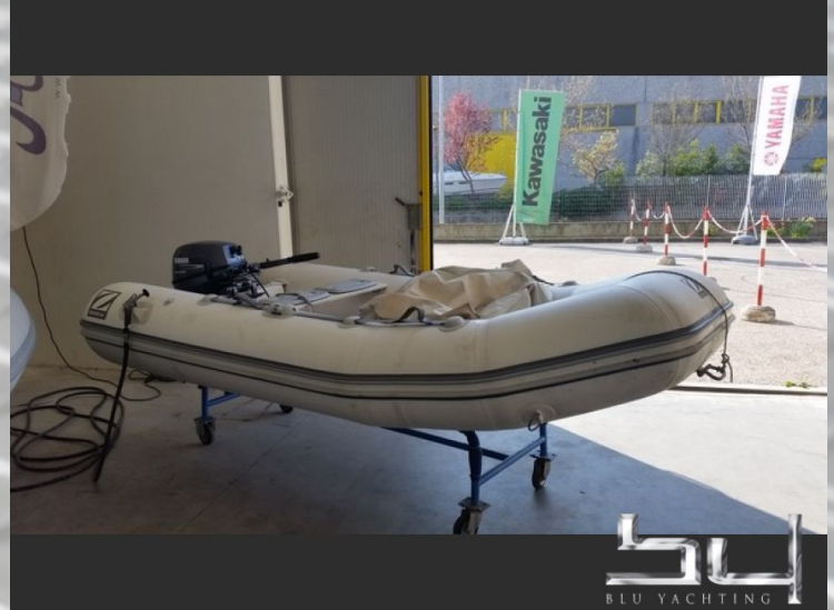
outside view - picture 8