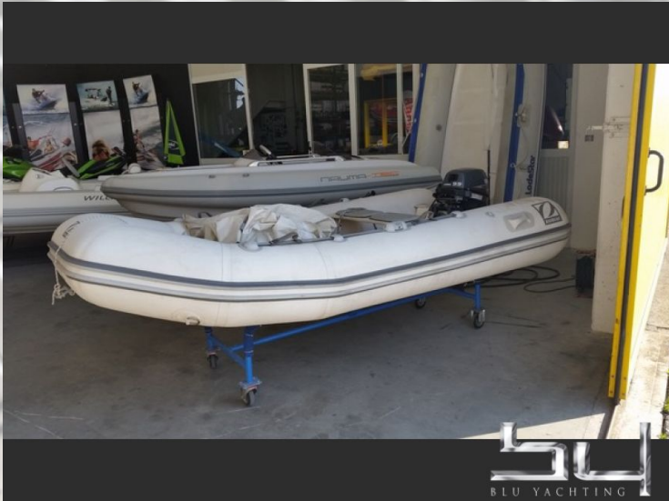
outside view - picture 1