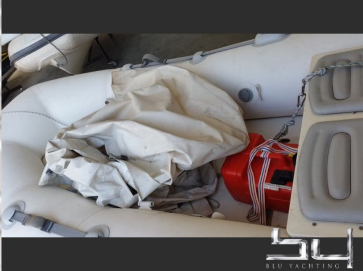
outside view - picture 7