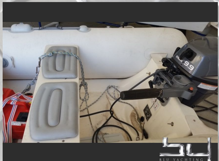
outside view - picture 6